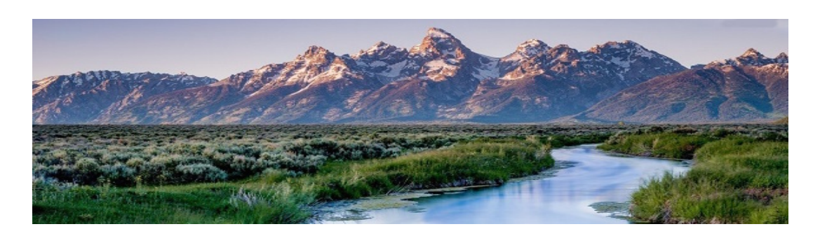
July 14, 2017