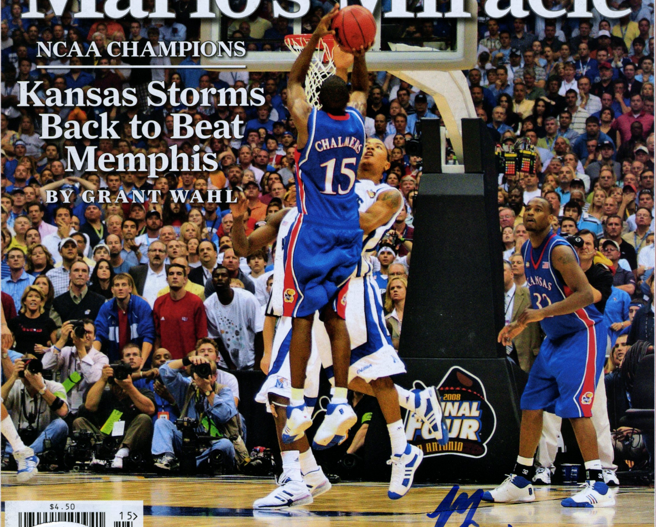
Mario Chalmers hits a three-pointer to push the title game into overtime