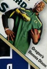
Oregon's Dennis Dixon